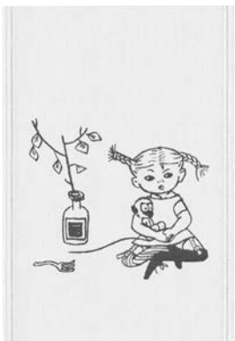
SOCKERDRICKA P2 Towel 35x50 cm 100% cotton