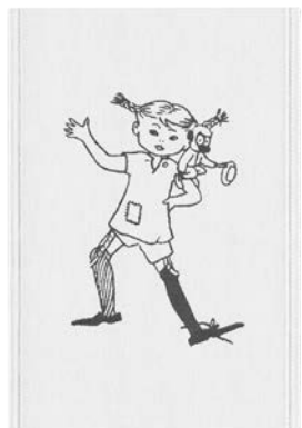
PIPPILOTTA P2 Towel 35x50 cm 100% cotton