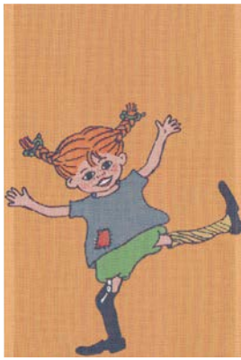
PIPPI 6C, P2 Towel 40x60 cm 100% cotton