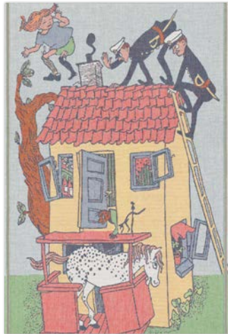
VILLA VILLEKULLA 6C P2 Brushed baby blanket 72x105 cm 100% cotton

A blanket from Ekelund is always woven with sustainable, organic, and eco-labeled materials. Additionally, they are GOTS-certified, providing extra assurance that no harmful substances are involved in the production – giving you peace of mind as a consumer.