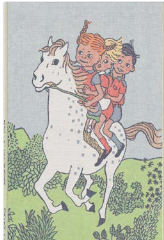
RIDTUR 6C P2 Brushed baby blanket 72x105 cm 100% cotton