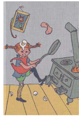
PANNKAKSKAOS 6C, P2 Towel 40x60 cm 100% cotton