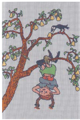
UPPOCHNER 6C, P2 Towel 40x60 cm 100% cotton