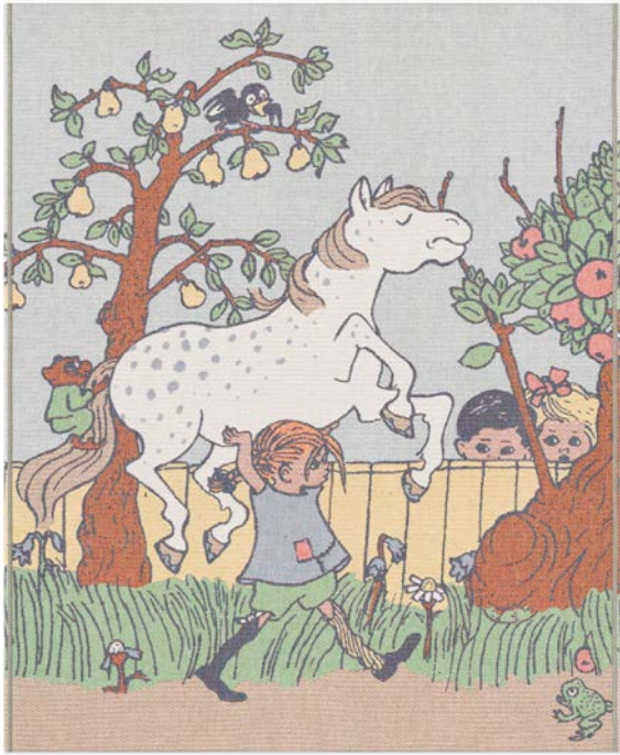
PÄRONSPRÅNG Brushed plaid 140x170 cm 100% cotton