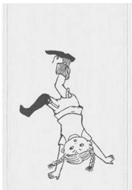
HOPPSAN P2 Towel 35x50 cm 100% cotton